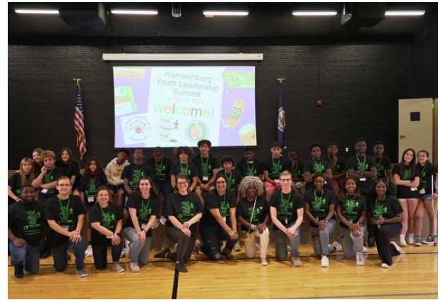
Faces 4 Change Youth Leaders